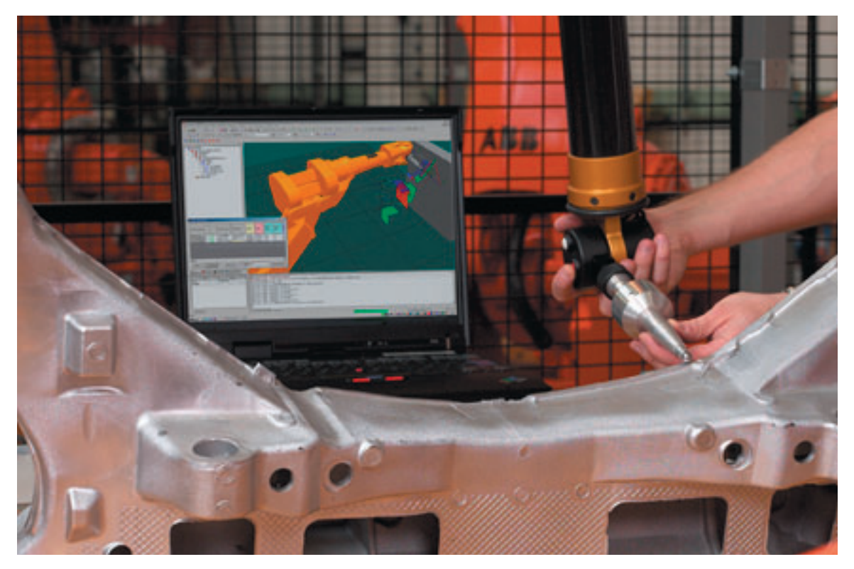
Offline programming of complex of foundry application