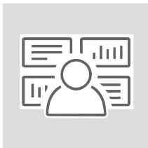
ABB can bundle these services within a tailor-made service agreement to meet your needs.