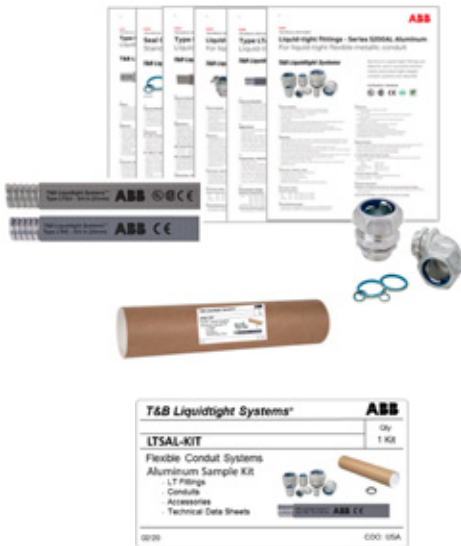
ABB Installation Products Inc. Electrification Business 860 Ridge Lake Blvd. Memphis, TN 38120