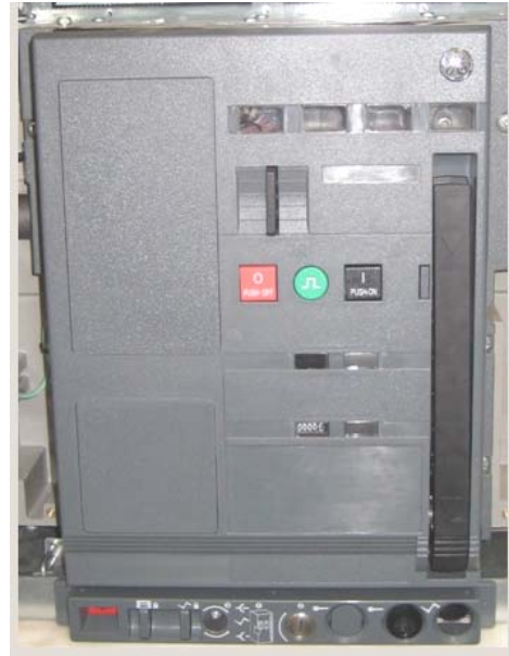
Figure 7 – Locked condition

These instructions do not cover all details or variations in equipment nor do they provide for every possible contingency that may be met in connection with installation, operation, or maintenance. Should further information be desired or should particular problems arise that are not covered sufficiently for the purchaser's purposes, the matter should be referred to the ABB Inc.