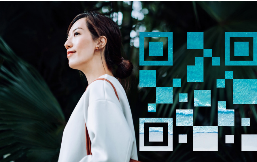
ABB EcoSolutions QR-code provides full transparency to environmental impacts across the entire product lifecycle. Products within the portfolio comply with a set of key performance indicators defined in ABB's circularity framework and carry an external, third-party verified environmental product declaration (ISO 14025).

— * IE5 Synchronous reluctance cast iron motors, shaft height 160-315