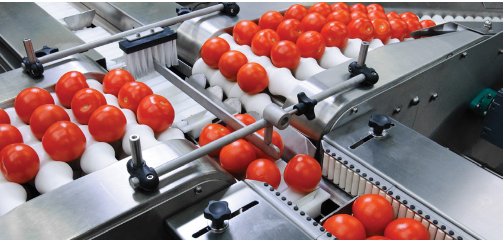
ABB Jokab Safety has long experience in developing products and solutions adapted for the harsh environment and requirements in the food and beverage industry.