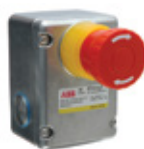
EStrong Emergency stop Robust design and reliable in harsh environments.