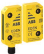
Eden Non-contact sensor Reliable in harsh environments, easy to install and highest level of safety.