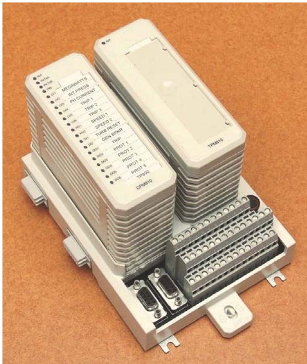
TP800 (CPM810 + TPM810 + TBU810)